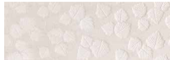
MANILA DECO ARENA 31,6x90x0,92cm P3470810 / 100162242 G271 Butech recomienda junta / Butech recommends joint: Colorstuk Rapid n Beige B22502016 / 100004308