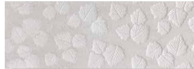
MANILA DECO ACERO 31,6x90x0,92cm P3470809 / 100162251 G271 Butech recomienda junta / Butech recommends joint: Colorstuk Rapid n Manhattan B22502002 / 100004295