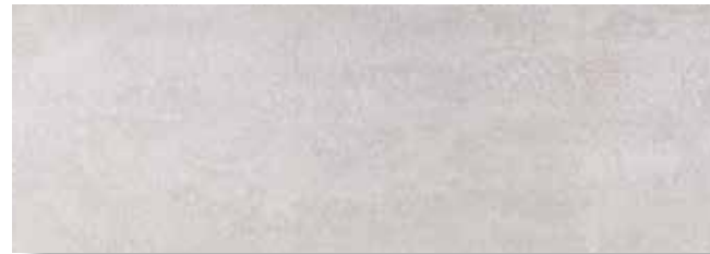
MANILA ACERO 31,6x90x0,92cm P3470807 / 100162224 G261 Butech recomienda junta / Butech recommends joint: Colorstuk Rapid n Manhattan B22502002 / 100004295