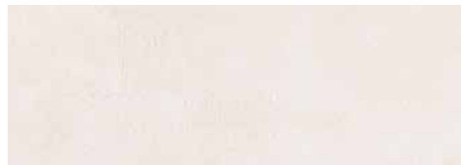
MANILA ARENA 31,6x90x0,92cm P3470808 / 100162233 G261 Butech recomienda junta / Butech recommends joint: Colorstuk Rapid n Beige B22502016 / 100004308