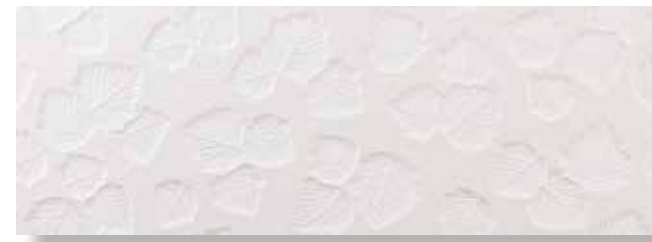
MANILA DECO BLANCO 31,6x90x0,92cm P3470806 / 100161477 G271 Butech recomienda junta / Butech recommends joint: Colorstuk Rapid n Blanco B22501001 / 100004294