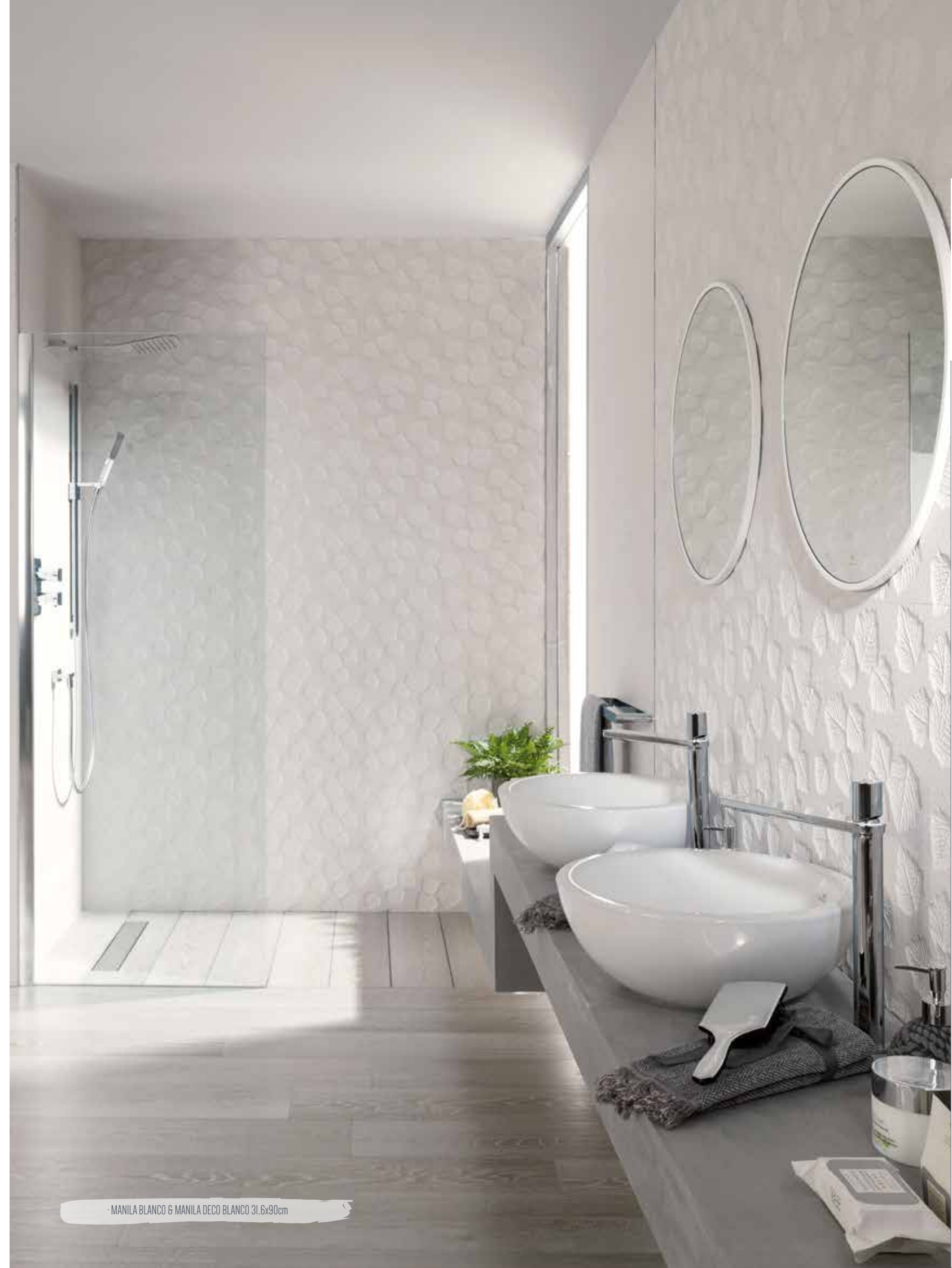
· MANILA BLANCO & MANILA DECO BLANCO 31,6x90cm