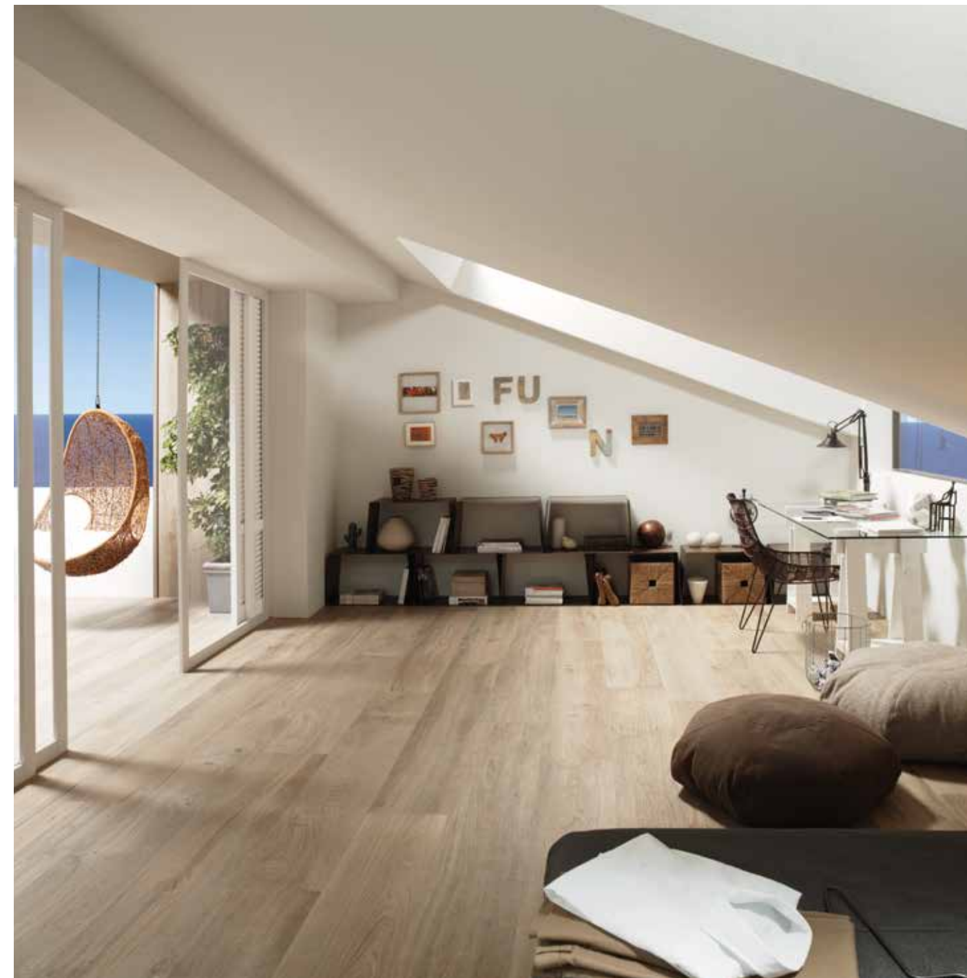
# MANHATTAN NATURAL 19,3x180cm & 29,4x180cm.

Butech recomienda junta / Butech recommends joint: Colorstuk Rapid n Manhattan B22502002 / 100004295