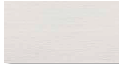
JAPAN BLANCO 31,6x59,2x0,9cm P3219273 / 100141159 G226 Butech recomienda junta / Butech recommends joint: Colorstuk Rapid n Gris B22502013 / 100004305 Colorstuk Rapid n Blanco B22501001 / 100004294