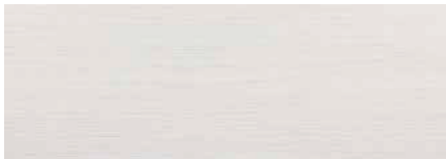
JAPAN BLANCO 31,6x90x0,9cm P3470669 / 100135524 G261 Butech recomienda junta / Butech recommends joint: Colorstuk Rapid n Gris B22502013 / 100004305