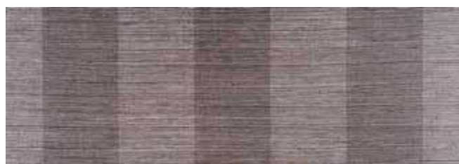
JAPAN LINE MARINE 31,6x90x0,9cm P3470672 / 100135528 G271 Butech recomienda junta / Butech recommends joint: Colorstuk Rapid n Cemento B22502004 / 100004297