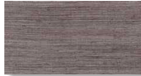
JAPAN MARINE 31,6x59,2x0,9cm P3219275 / 100141181 G226 Butech recomienda junta / Butech recommends joint: Colorstuk Rapid n Cemento B22502004 / 100004297