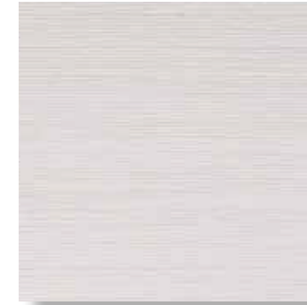
JAPAN BLANCO 44,3x44,3x1cm P2460048 / 100140546 G311 Butech recomienda junta / Butech recommends joint: Colorstuk Rapid n Gris B22502013 / 100004305