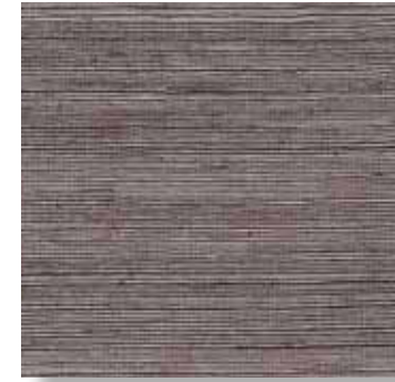
JAPAN MARINE 44,3x44,3x1cm P2460049 / 100140547 G311 Butech recomienda junta / Butech recommends joint: Colorstuk Rapid n Cemento B22502004 / 100004297