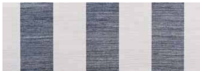
JAPAN LINE BLANCO 31,6x90x0,9cm P3470665 / 100135526 G271 Butech recomienda junta / Butech recommends joint: Colorstuk Rapid n Gris B22502013 / 100004305