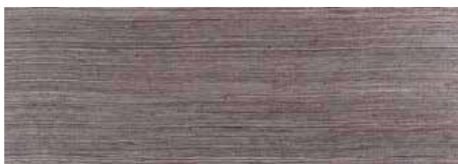
JAPAN MARINE 31,6x90x0,9cm P3470658 / 100135530 G261 Butech recomienda junta / Butech recommends joint: Colorstuk Rapid n Cemento B22502004 / 100004297