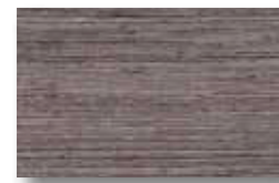
JAPAN MARINE-M 20x31,6x0,9cm P3149883 / 100160372 G205 Butech recomienda junta: Butech recommends joint: Colorstuk Rapid n Cemento B22502004 / 100004297