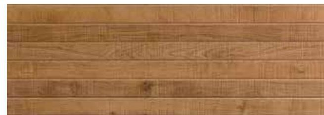
LISTON CHELSEA CAMEL 31,6x90x1,18cm P3470850 / 100179327 Butech recomienda junta / Butech recommends joint: Colorstuk Rapid n Tabaco B22502011 / 100004304 G271