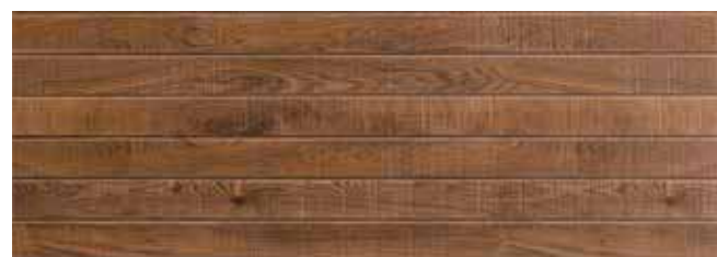
LISTON CHELSEA NUT 31,6x90x1,18cm P3470851 / 100179362 Butech recomienda junta / Butech recommends joint: Colorstuk Rapid n Moka B21522220 / 100060549 G271