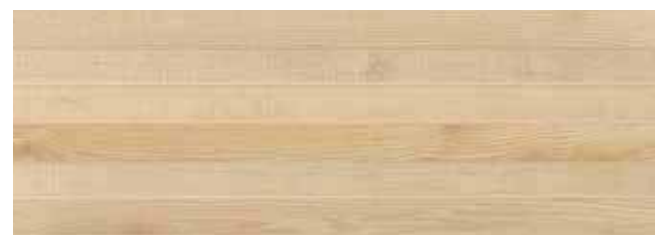
LISTON CHELSEA ARCE 31,6x90x1,18cm P3470848 / 100179319 Butech recomienda junta / Butech recommends joint: Colorstuk Rapid n Tabaco B22502011 / 100004304 G271