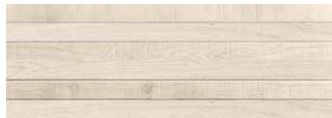
LISTON CHELSEA BONE 31,6x90x1,18cm P3470846 / 100179360 Butech recomienda junta / Butech recommends joint: Colorstuk Rapid n Beige B22502016 / 100004308 G271