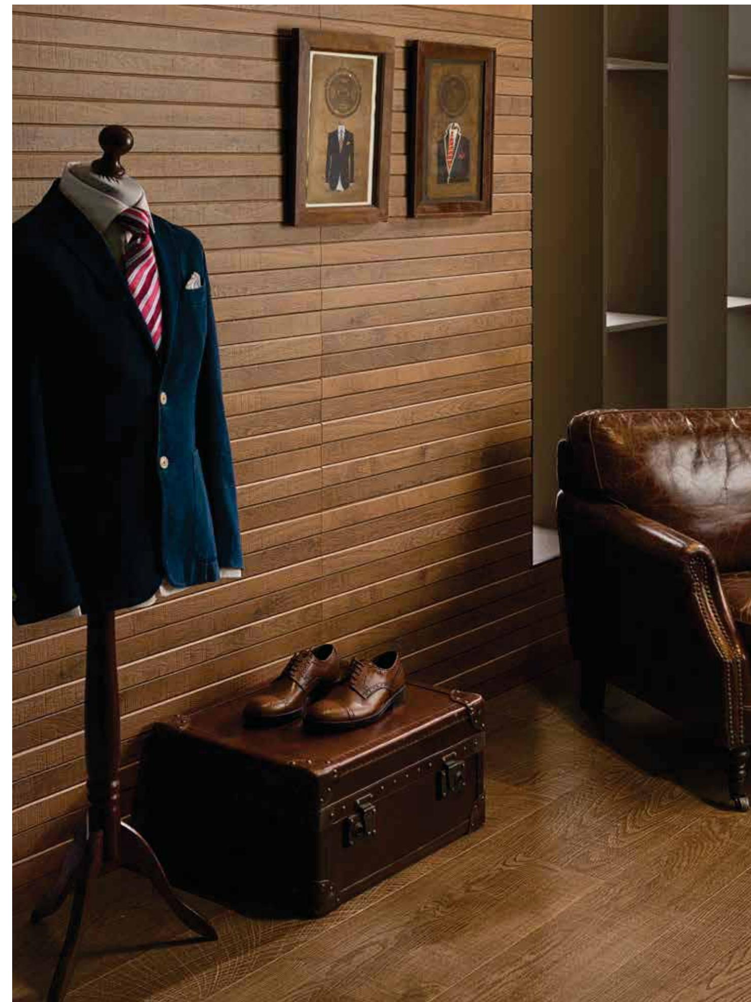
# LISTON CHELSEA NUT 31,6x90cm

*valores aproximados. *approximated values.