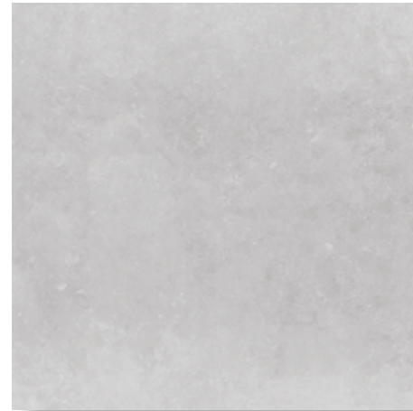
BLUESTONE ACERO S-R 80x80x1,2cm P1760093 / 100173994 G369 59,6x59,6x1,1cm P1857003 / 100179074 G354 Butech recomienda junta / Butech recommends joint: Colorstuk Rapid n Manhattan B22502002 / 100004295