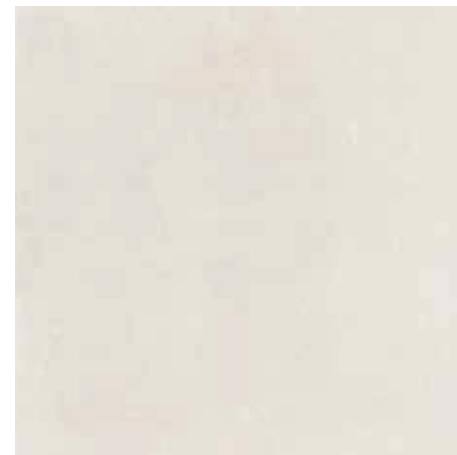
BLUESTONE BONE S-R 80x80x1,2cm P1760095 / 100179075 G369 59,6x59,6x1,1cm P1857005 / 100179056 G354 Butech recomienda junta / Butech recommends joint: Colorstuk Rapid n Gris B22502013 / 100004305