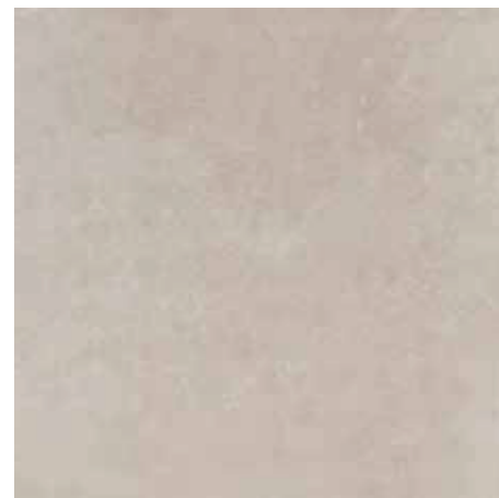
BLUESTONE TOPO S-R 80x80x1,2cm P1760092 / 100173975 G369 59,6x59,6x1,1cm P1857001 / 100179065 G354 Butech recomienda junta / Butech recommends joint: Colorstuk Rapid n Manhattan B22502002 / 100004295