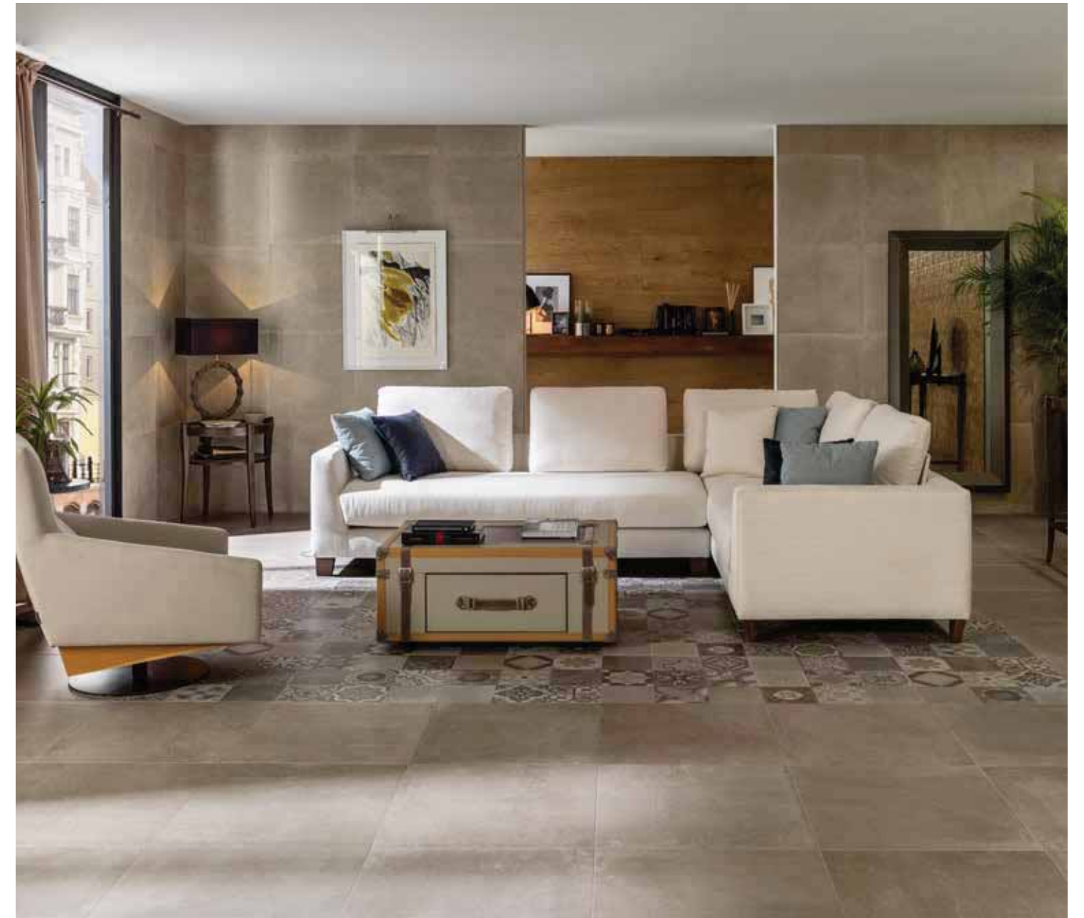
# BLUESTONE TOPO 59,6x59,6cm