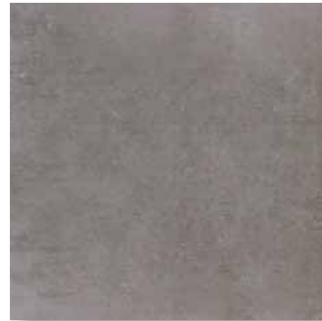
BLUESTONE SILVER S-R 80x80x1,2cm P1760094 / 100173974 G369 59,6x59,6x1,1cm P1857002 / 100179057 G354 Butech recomienda junta / Butech recommends joint: Colorstuk Rapid n Cemento B22502004 / 100004297