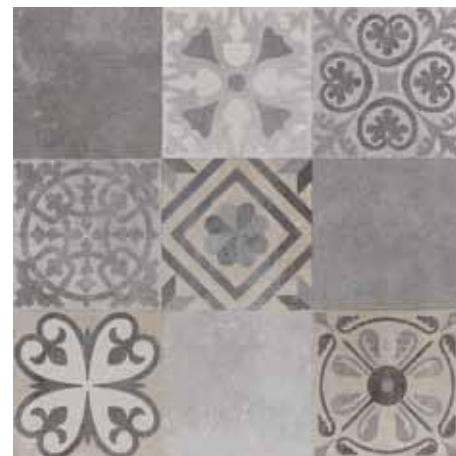
DECO BLUESTONE S-R 80x80x1,2cm P1760096 / 100179066 G372 59,6x59,6x1,1cm P1857004 / 100179076 G359 Butech recomienda junta / Butech recommends joint: Colorstuk Rapid n Cemento B22502004 / 100004297