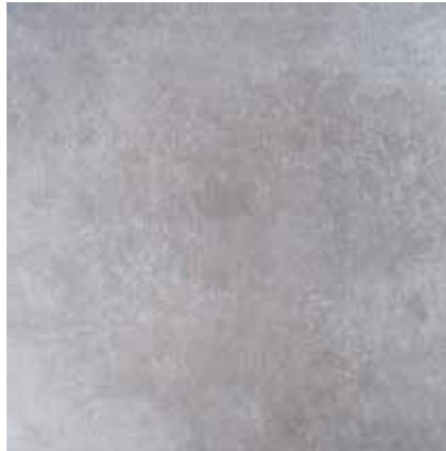
ASTON ACERO S-R 59,6x59,6x1,1cm P1856868 / 100137568 G354 Butech recomienda junta / Butech recommends joint: Colorstuk Rapid n Manhattan B22502002 / 100004295