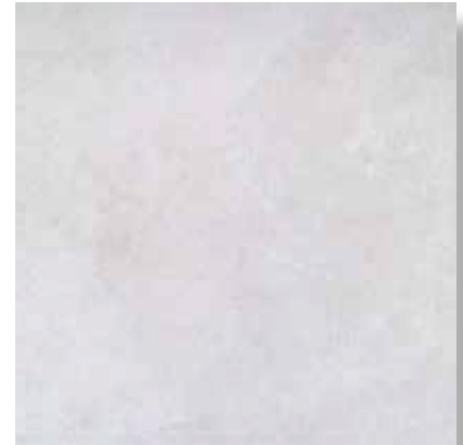
ASTON CALIZA S-R 59,6x59,6x1,1cm P1856866 / 100137601 G354 Butech recomienda junta / Butech recommends joint: Colorstuk Rapid n Gris B22502013 / 100004305