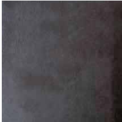
ASTON ANTRACITA S-R 59,6x59,6x1,1cm P1856867 / 100137569 G354 Butech recomienda junta / Butech recommends joint: Colorstuk Rapid n Antracita B22502005 / 100004298