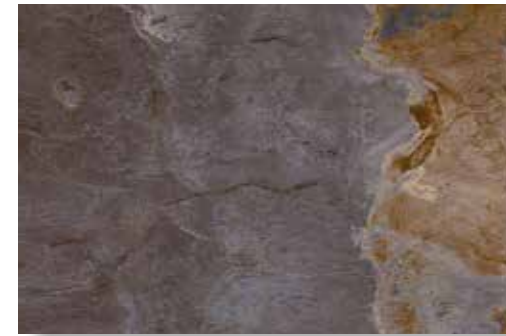
TIBET BLACK S-R 43,5x65,9x1,1cm P1981221 / 100097033 G344 Butech recomienda junta / Butech recommends joint: Colorstuk Rapid n Negro B22502006 / 100004299