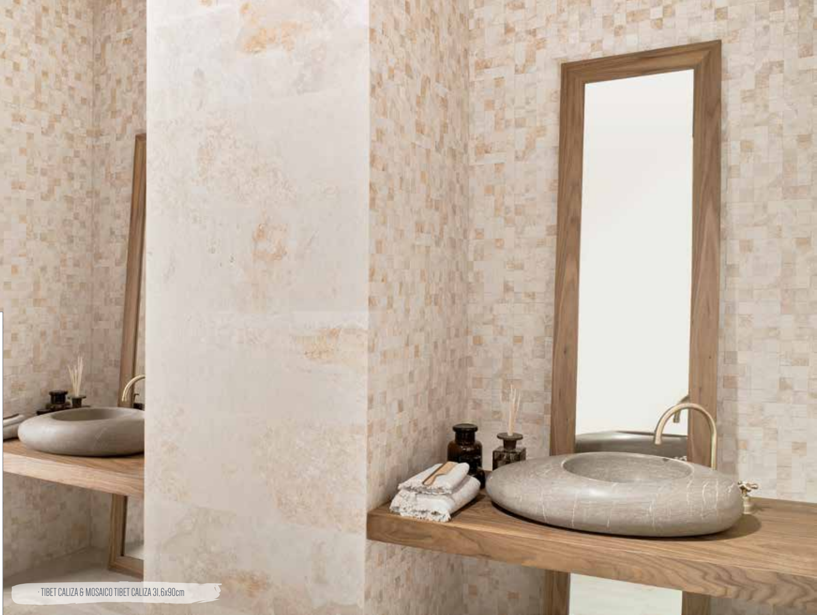
TIBET CALIZA 6 MOSAICO TIBET CALIZA 31,6x90cm