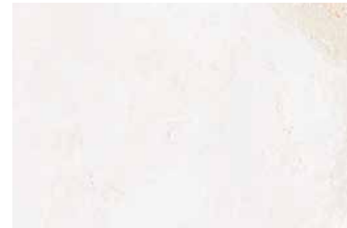
TIBET CALIZA S-R 43,5x65,9x1,1cm P1981222 / 100097035 G344 Butech recomienda junta / Butech recommends joint: Colorstuk Rapid n Gris B22502013 / 100004305 Colorstuk Rapid n Beige B22502016 / 100004308