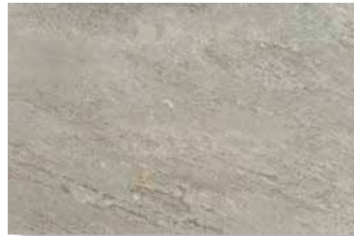
ARIZONA STONE S-R 43,5x65,9x1,1cm P1956630 / 100088091 G344 Butech recomienda junta / Butech recommends joint: Colorstuk Rapid n Cemento B22502004 / 100004297