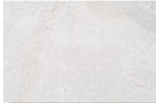
ARIZONA CALIZA S-R 43,5x65,9x1,1cm P1956631 / 100088088 G344 Butech recomienda junta / Butech recommends joint: Colorstuk Rapid n Cemento B22502004 / 100004297 Colorstuk Rapid n Gris B22502013 / 100004305