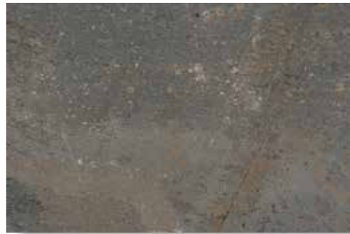
ARIZONA ANTRACITA S-R 43,5x65,9x1,1cm P1956628 / 100088078 G344 Butech recomienda junta / Butech recommends joint: Colorstuk Rapid n Antracita B22502005 / 100004298