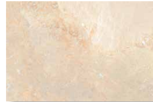
TIBET ARENA S-R 43,5x65,9x1,1cm P1981224 / 100097459 G344 Butech recomienda junta / Butech recommends joint: Colorstuk Rapid n Beige B22502016 / 100004308