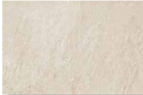
ARIZONA ARENA S-R 43,5x65,9x1,1cm P1956629 / 100088083 G344 Butech recomienda junta / Butech recommends joint: Colorstuk Rapid n Cemento B22502004 / 100004297 Colorstuk Rapid n Beige B22502016 / 100004308